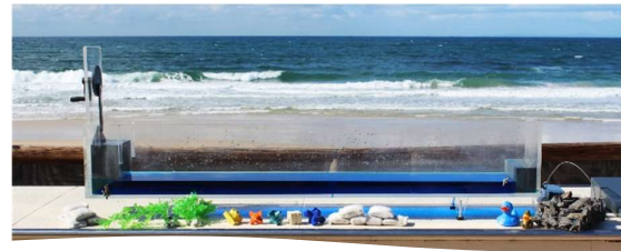
JBP wave tank at Kings Beach

The focus of discussions in Round 1 have included: