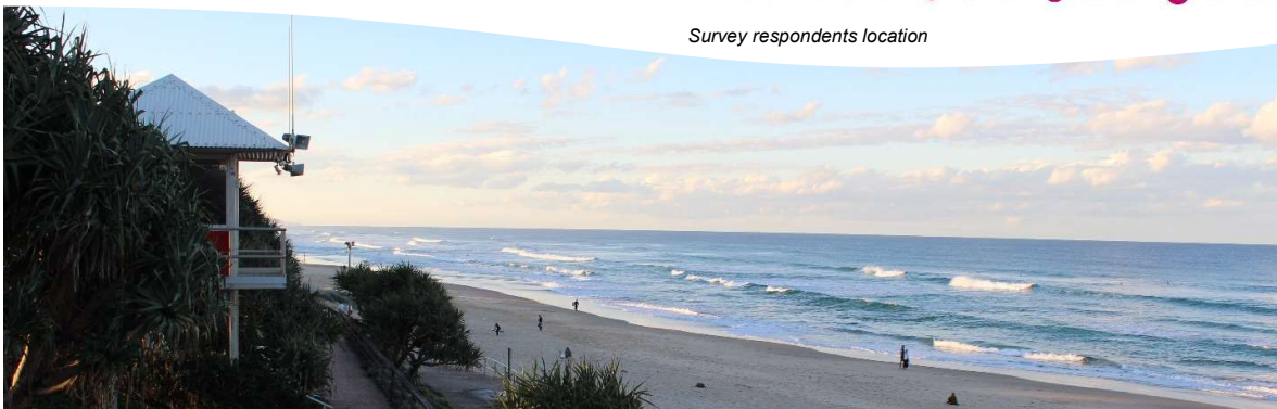
Looking north from Coolum Beach Surf Life Saving Club