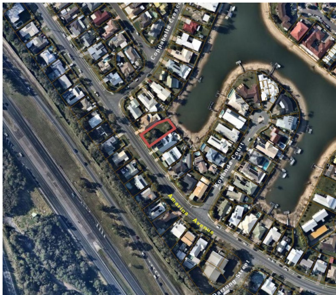
Figure 4: Land subject to proposed amendment

Under the Sunshine Coast Planning Scheme 2014 , the subject land is currently included in the Community facilities zone and annotated 20. Utility installation (Local utility) (refer to Figure 5 ).