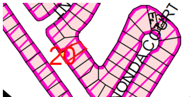
Figure 4: Proposed Zoning

Low Density Residential Zone Precinct LDR1 (Protected Housing Area) Community Facilities Zone 20. Utility installation (Local utility)