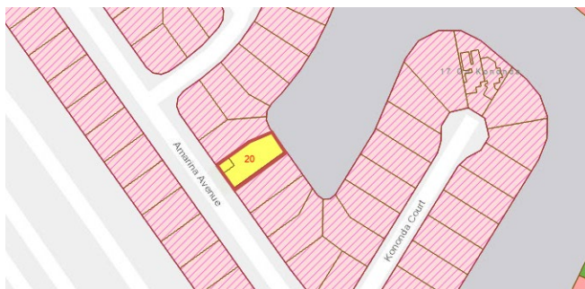
Figure 3: Current Zoning

Low Density Residential Zone Precinct LDR1 (Protected Housing Area) Community Facilities Zone 20. Utility installation (Local utility)