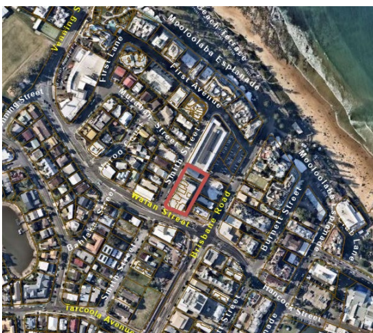
Figure 1: Land subject to proposed amendment

Under the Planning Scheme, the subject land is currently included in the District centre zone in the