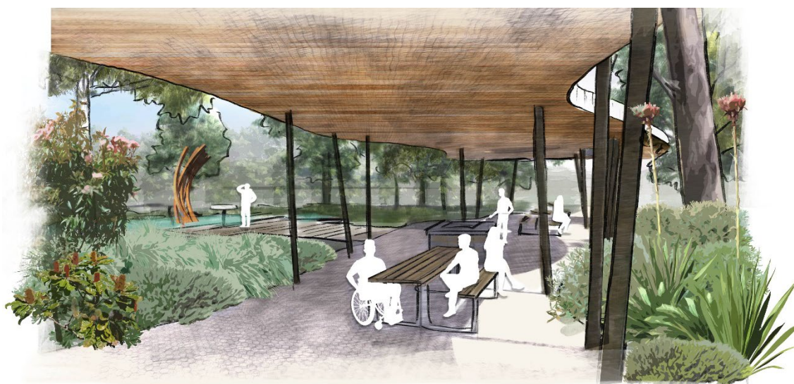
Figure 3: Artist impressions of improvement ideas (Top to bottom: Reimagined Park Entry, Adventure Play, Communal Areas)