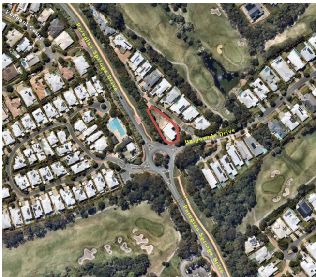
Figure 1: Land subject to proposed amendment

Under the Planning Scheme, the subject land is located in the Peregian South Local plan area and is currently included in the Sport and recreation zone (refer Figure 2 ).