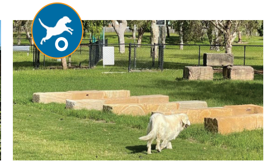
Dog agility equipment area