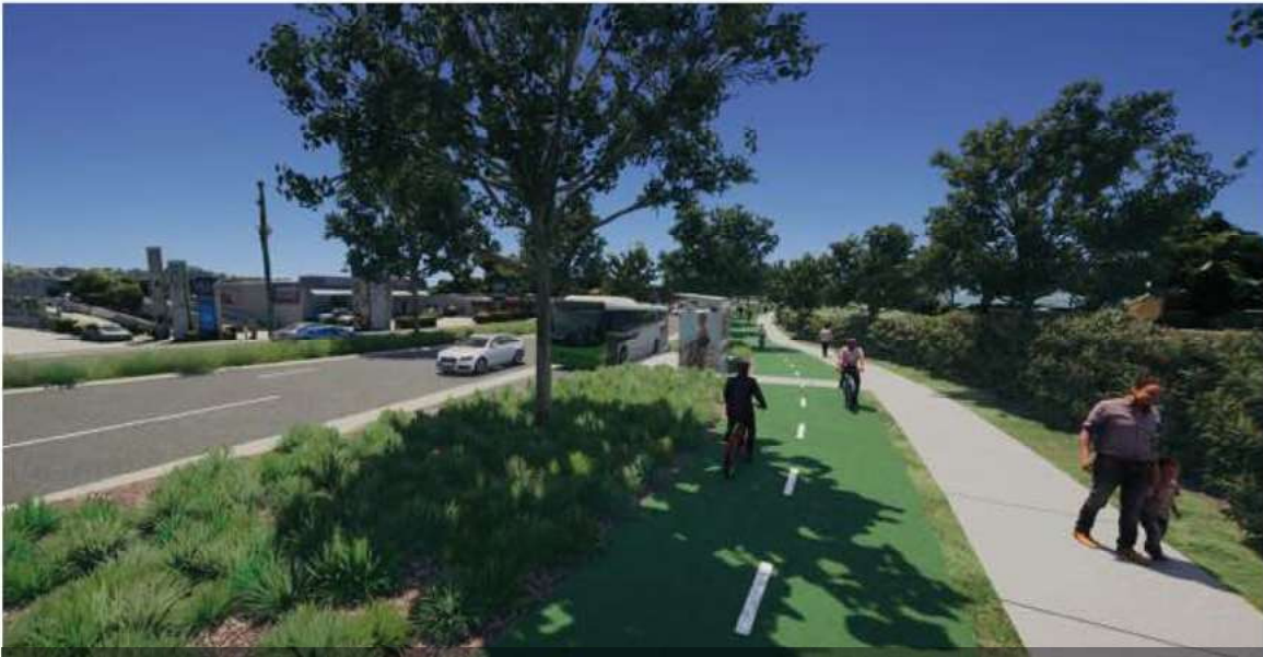
Artist impression of Sugar Road upgrade that includes two-way cycle track and pedestrian pathway which follows the length of the corridor. Illustration is indicative only.

With Maroochydore continuing to grow, more workers, residents and visitors are travelling to and from the heart of the Sunshine Coast.