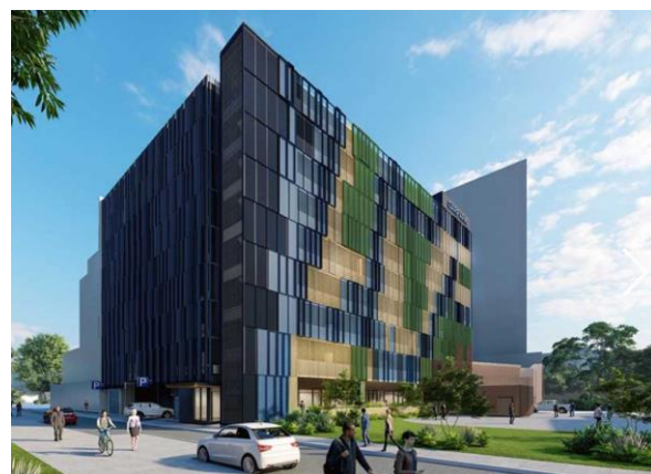
Diagram 1: Artist's image of the Lightning Lane car park

Construction commenced in late 2022 and the project is anticipated to be completed by December 2023 (weather permitting).