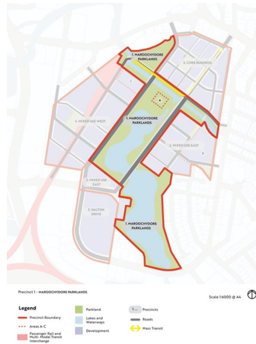
Diagram 2: Proposed Open Space Network (Parklands Precinct)