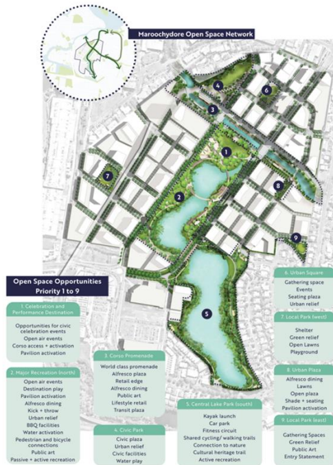
Diagram 1: Proposed Open Space Network