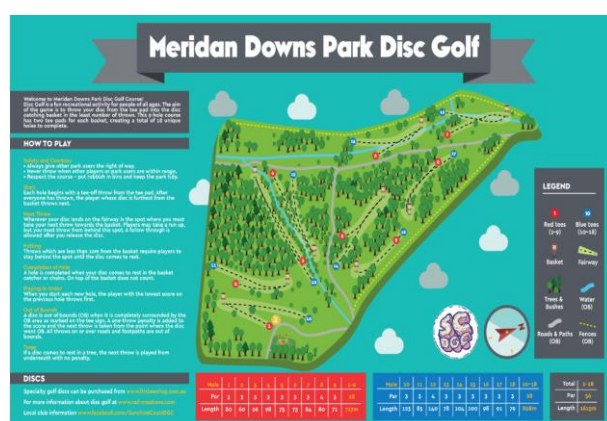
Figure 2 - Example information sign