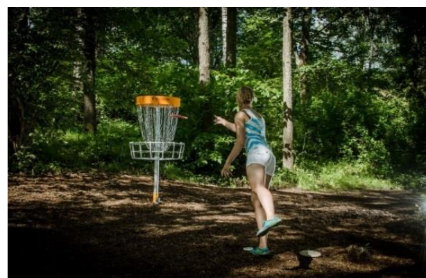
Figure 3 - Example tee marker with disc catcher basket