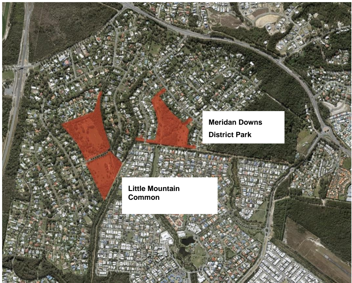
Figure 5 - Dog Off-Leash Areas – Meridan Downs Park and Little Mountain Common