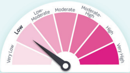
From existing Planning Scheme