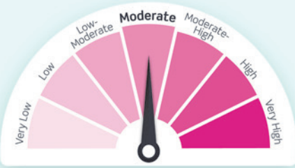
From existing Planning Scheme

The attached map identifies a location reference for some of the proposed planning directions. Not all proposed planning directions are mapped.