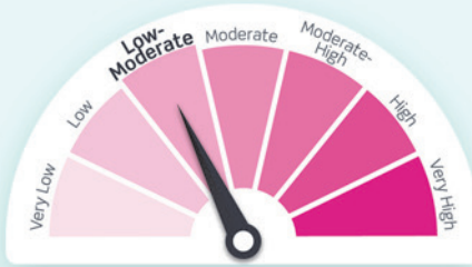
From current on-ground situation