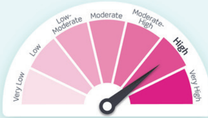
From current on-ground situation