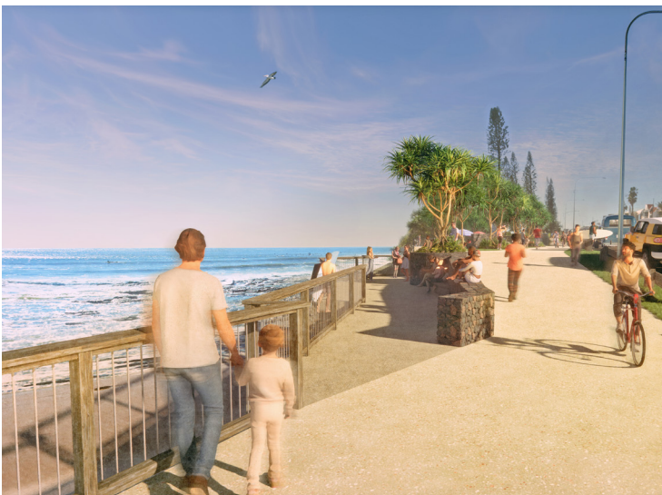
Figure 3: Artist Impression A