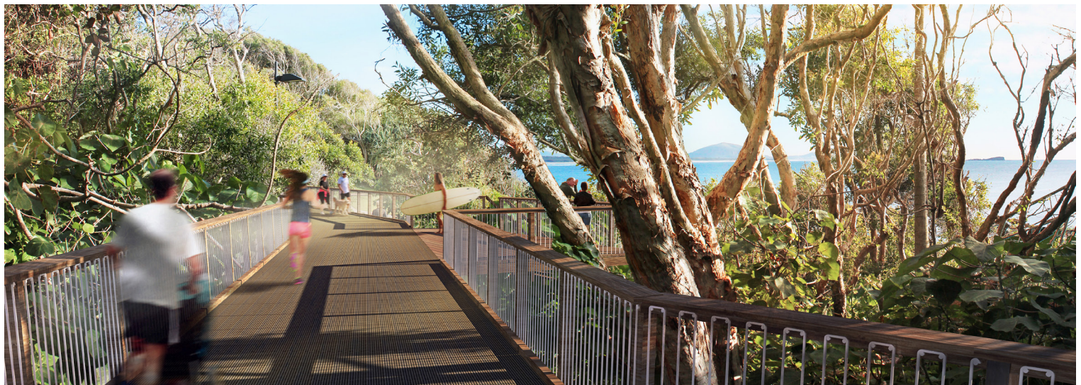
Figure 6: Artist Impression A