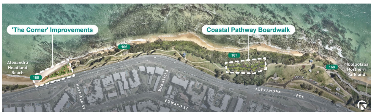
Figure 1: Alex Bluff Foreshore Park - Project Location