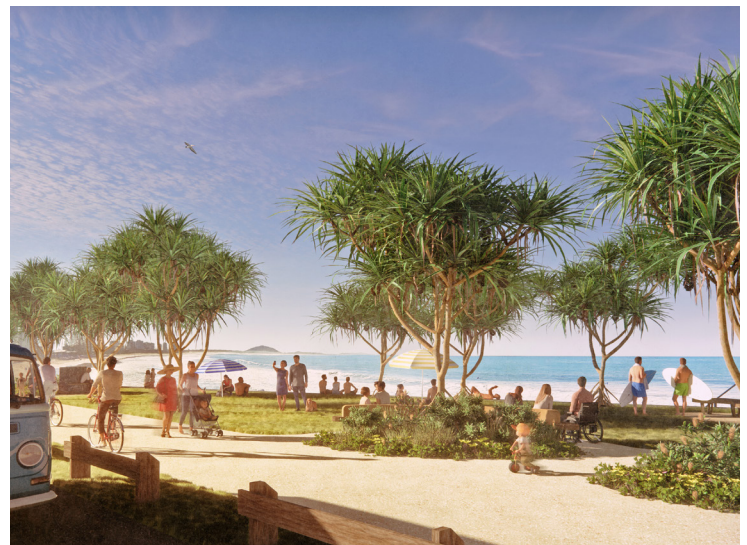
Figure 4: Artist Impression B