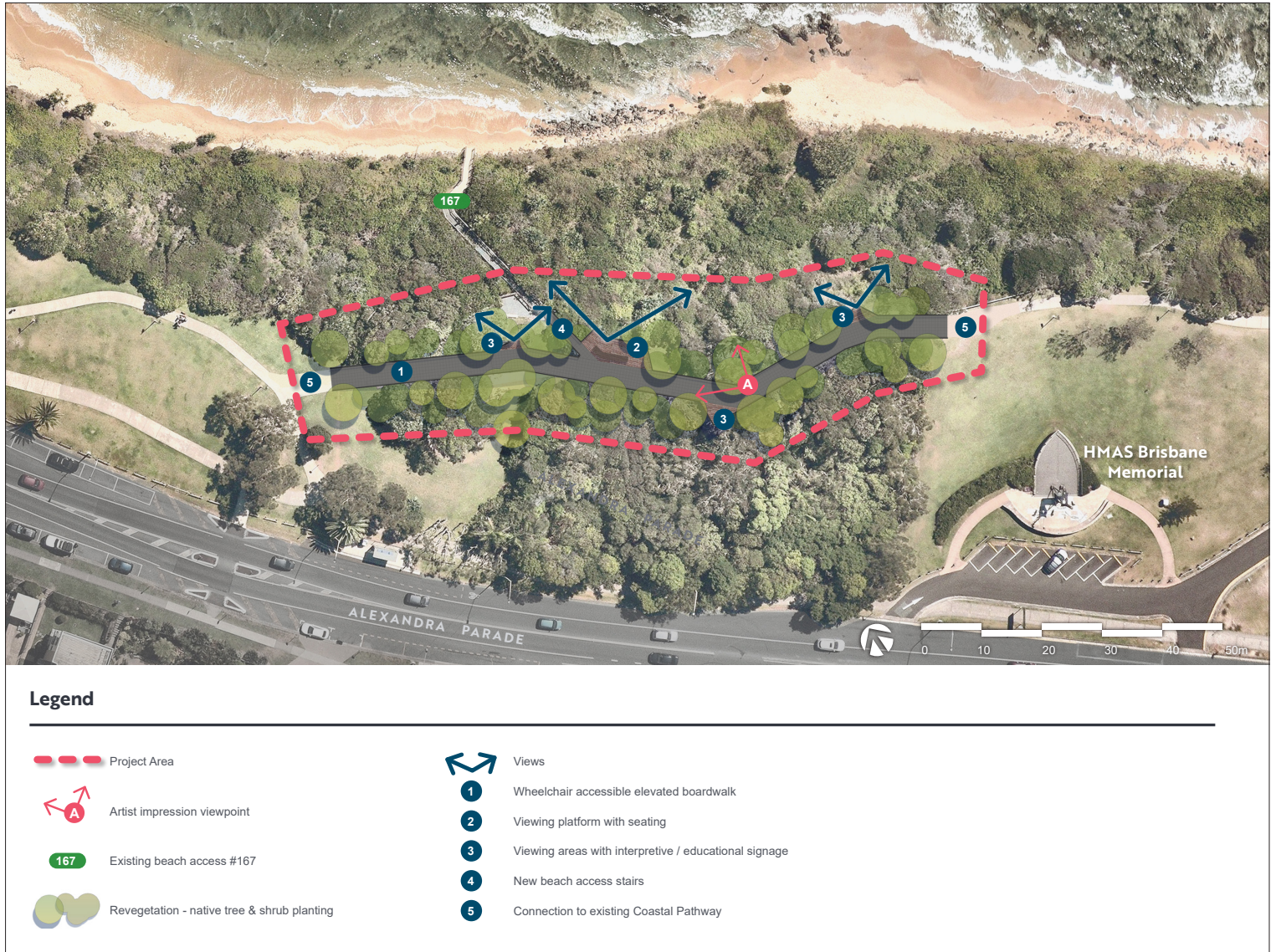
Figure 5: Concept Design Plan